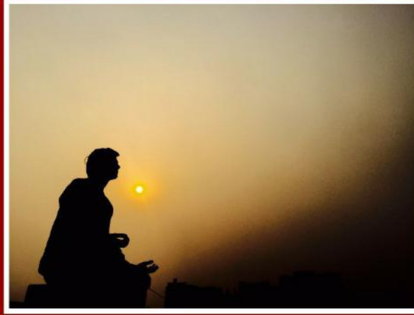
Retreat classes in English

Group retreat on 'Balancing Activity with Meditation' is scheduled at YSS Noida Ashram from February 4-5, 2017. Classes for this group retreat will be conducted in English. Register by clicking here.